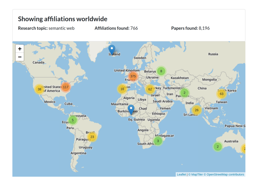
Fig. 2. Map visualization of affiliations publishing works matching "semantic web"

search is matched on paper and/or conference/journal titles. When the search button is clicked a map visualization is rendered as shown in Figure 2. The map shows all of the affiliations that have at least one publication in the results. If there are multiple affiliations nearby in the map, a cluster will be displayed with the number of affiliations in the cluster. As the user zooms in on a particular region, the clusters will become more fine-grained until markers are associated with only one affiliation. If such a marker is clicked, the number of matching publications and a list of publications are shown for that affiliation.