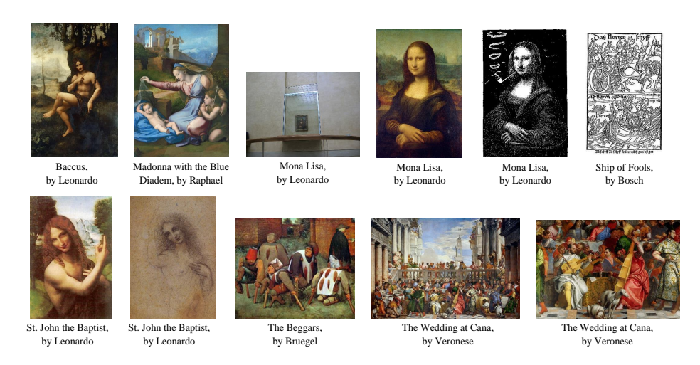
Fig. 1: Images of the Wikipedia articles about paintings from the 16<sup>th</sup> century displayed at the Louvre.