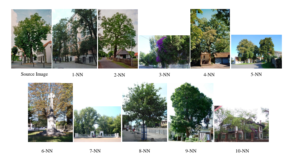
Fig. 1: 10 nearest neighbors of an image of Hopsten Marktplatz using HOG

- Color Layout Descriptor: We divide the image into blocks and for each block we compute the mean (YCbCr) color. Afterwards the Discrete Cosine Transform is computed for each color channel. Finally the concatenation of the transforms is used as the descriptor vector, with 192 dimensions.